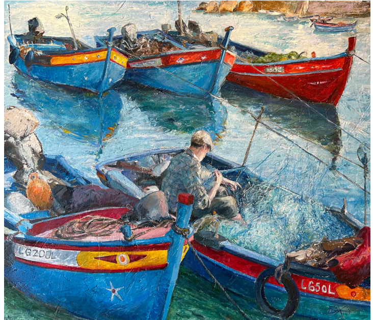
'Being prepared'. The harbour at Sagres in Portugal, by Cliff Baxendale